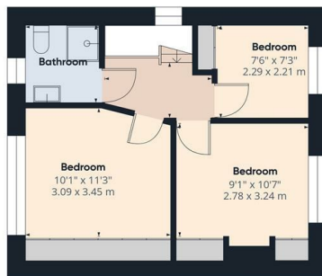
Floor 1 Building 1